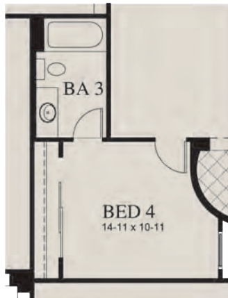
BEDROOM 4 OPTION W/ FULL BATH 3