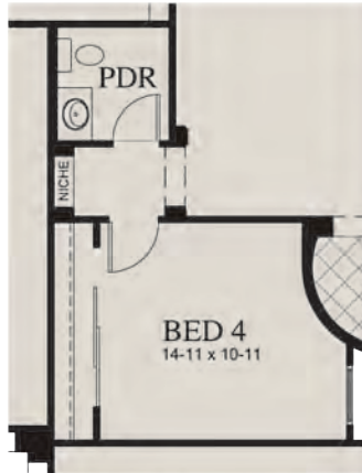
BEDROOM 4 OPTION